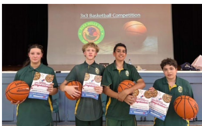
1 st place - Heat