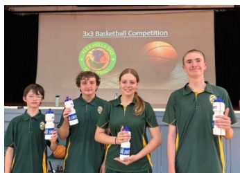
3 rd Place - Raptors

There was great skills shown throughout the day and a healthy competition. Congratulations to the Heat for claiming first prize (a basketball and Dominos voucher), the 76ers for finishing runners up (drink bottle and dominos voucher) and finally the Raptors for claiming the bronze (drink bottle).