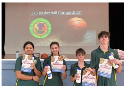
2 nd Place - 76ers